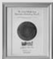
Company of the Year 1999 Middle East Information Technology Award