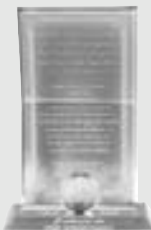
Sheikh Khalifa Excellence Quality Appreciation Certificate - Seventh Cycle 2005-2006