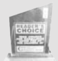
Reader's Choice 1998 Awards for Excellence