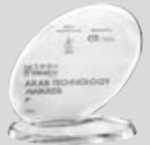
The Best ICT Company 2006 Arab Technology Award