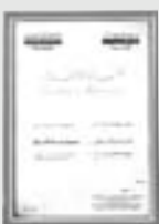
Winner of the DUBAI QUALITY APPRECIATION PROGRAM Company of the Year (Services)